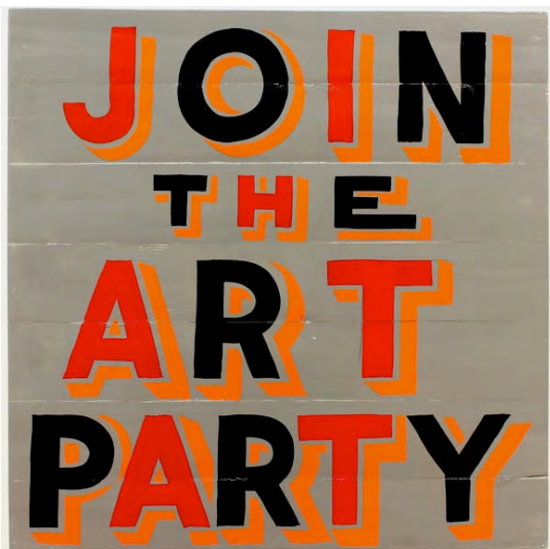
Bob and Roberta Smith