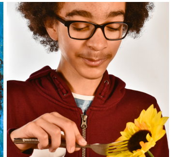
Channel idents Banbury and Bicester College, Activate Learning