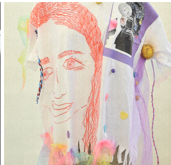
Self-portrait garments University of Central Lancashire