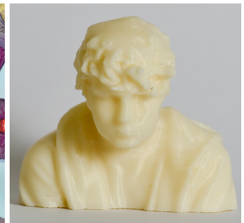
3D-printed self-portraits Coleg Sir Gâr