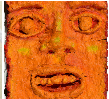
Papier-mâché Guildford College, Activate Learning