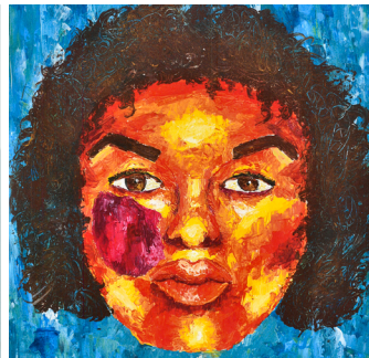
Acrylics Plymouth College of Art