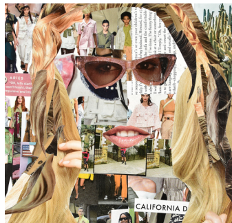
Fashion magazine collage Istituto Marangoni