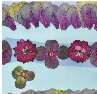
Dried pressed flowers University of Sussex