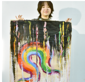
Large-scale portraiture Reading College