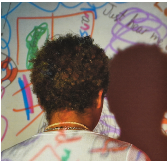
Acetate sheets and projection London Metropolitan University