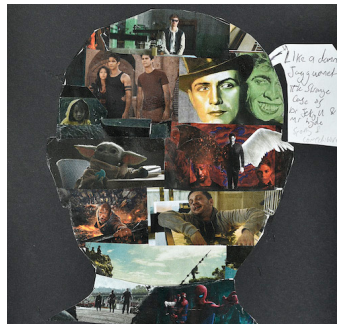
Film collage silhouettes London Screen Academy